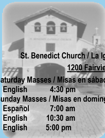
St. Benedict Church / La Iglesia de San Benito

Office Hours / las horas de oficina: 7:30am to 3:30pm 670 College Street, Hollister CA 95023 Phone: (831) 637-4157 FAX: (831) 637-4164