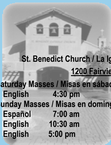
St. Benedict Church / La Iglesia de San Benito

Office Hours / las horas de oficina: 7:30am to 3:30pm 670 College Street, Hollister CA 95023 Phone: (831) 637-4157 FAX: (831) 637-4164